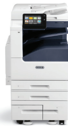
Xerox® VersaLink® C7020/C7025/C7030 Colour Multifunction Printer