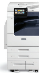
Xerox® VersaLink® B7025/B7030/B7035 Multifunction Printer