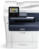
Xerox® VersaLink® B405 Multifunction Printer