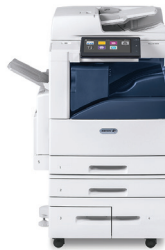
Xerox® AltaLink® C8030/C8035/C8045/ C8055/C8070 Colour Multifunction Printer