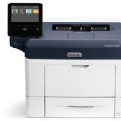
Xerox® VersaLink® B400 Printer