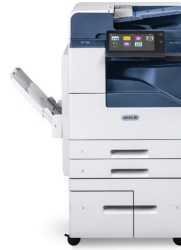
Xerox® AltaLink® B8045/8055/8065/ 8075/8090 Multifunction Printer

To learn more about ConnectKey Technology, go to www.xerox.com .