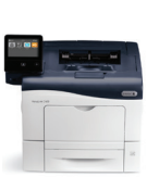
Xerox® VersaLink® C400 Colour Printer