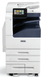
Xerox® VersaLink® C7020/C7025/C7030 Color Multifunction Printer