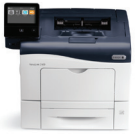
Xerox® VersaLink® C400 Color Printer